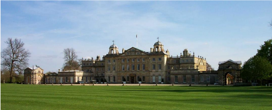
Image from the Badminton House website

Badminton House is a Grade I Listed Building and has been the principal seat of the Dukes of Beaufort since the late 17th century, when the family moved from Raglan Castle. Aside from being the only stately home to have given its name to an Olympic sport, it has many interesting associations. It was the home of Queen Mary for much of World War II.